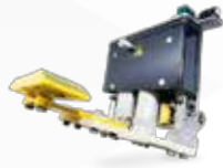
3rd RAIL CURRENT COLLECTORS