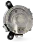
frost® GROUND CONTACTS