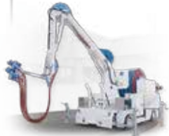
FOR CONTAINER VESSELS