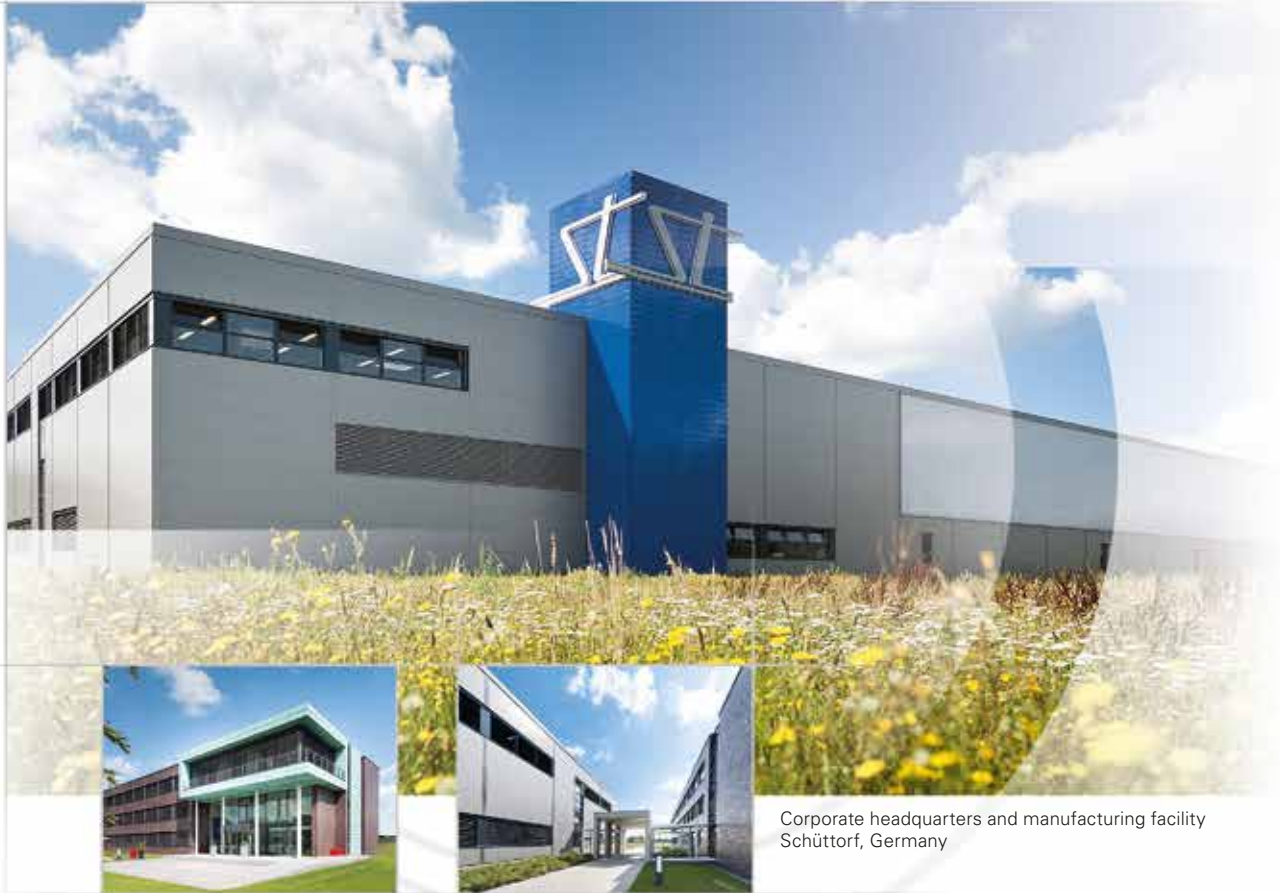
Corporate headquarters and manufacturing facility Schüttorf, Germany

We are one of the world's leading manufacturers of energy and data transfer components and systems in industrial and transport technology.