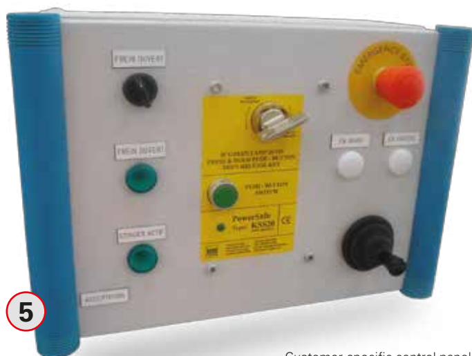
Customer-specific control panel