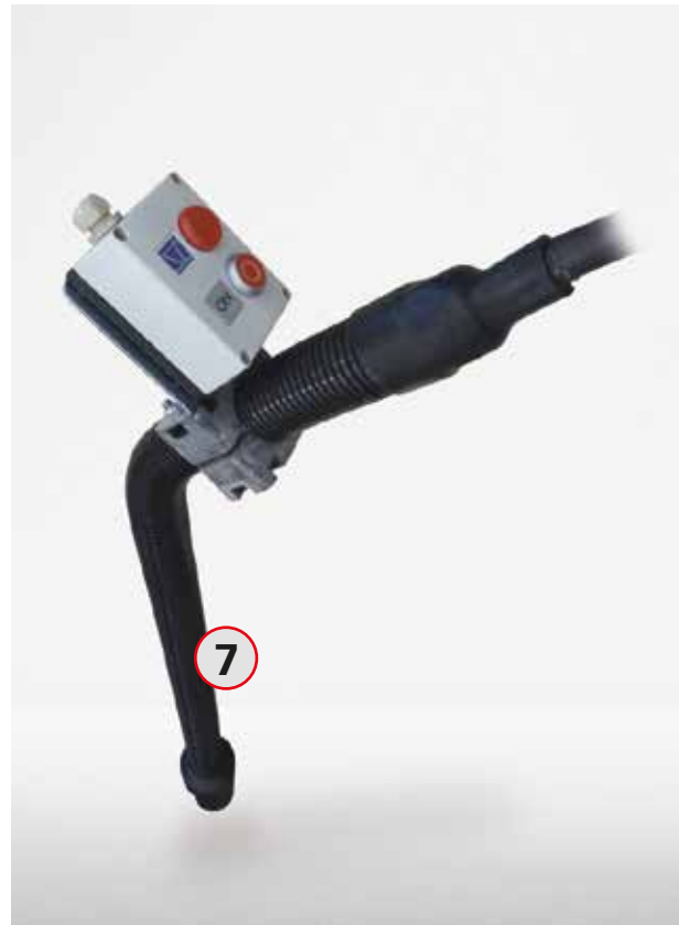
Customer-specific plug version