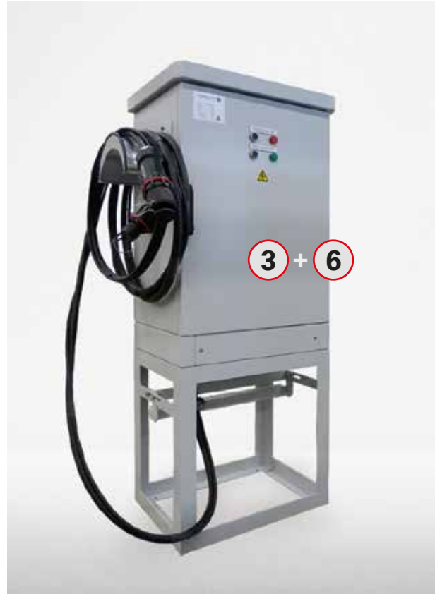
Stationary stinger system

Retrofitting in existing depots possible.