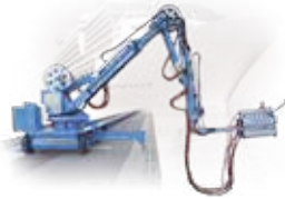
FOR CRUISE SHIPS