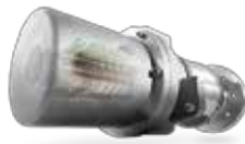
SLIP RING ASSEMBLIES